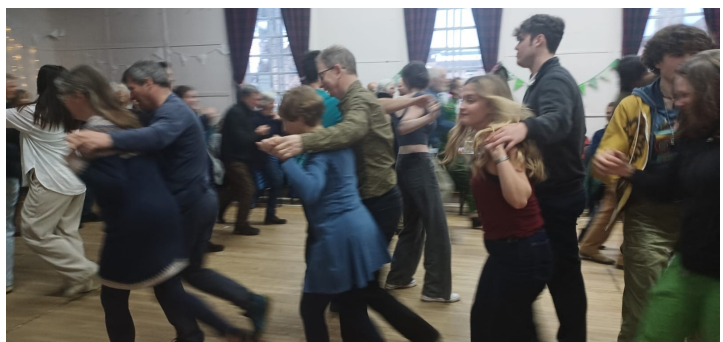
Roll on next year....