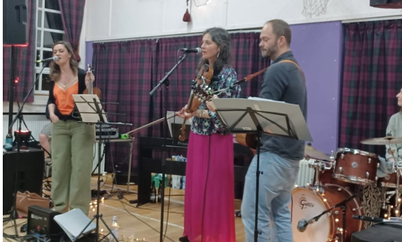
The fabulous Get Reel